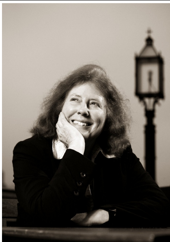
AT THE LAST GENERAL ELECTION IN 2005

Although it may be different in some other constituencies, the figures here in Cardiff North are crystal clear: